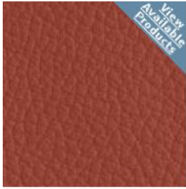
St James Red