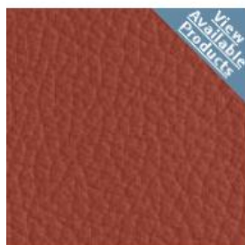
St James Red