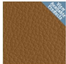
Tan Pre 1997