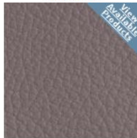
Dark Rose Quarts